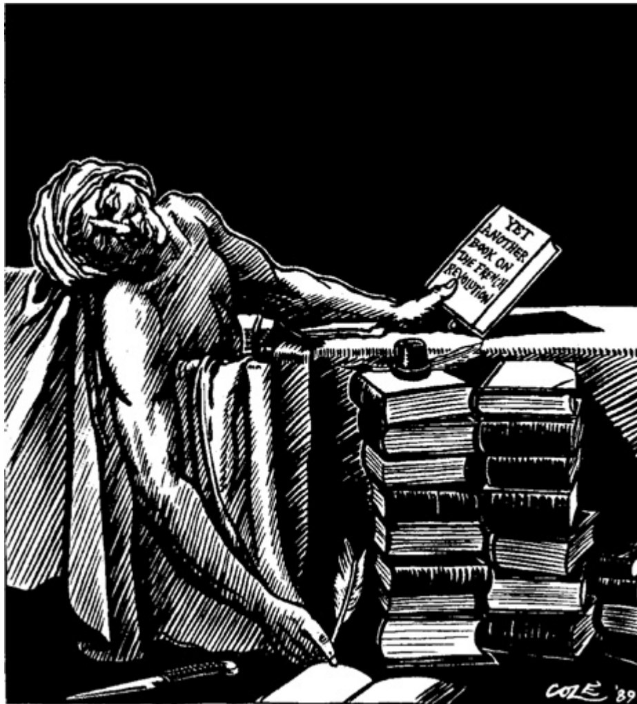
11. Scholarly overload: The reaction of reviewers to the bicentenary ( Daily Telegraph , 3 June 1989).

One of the favourite mantras of the Revolution's classic interpreters was taken from Georges Clemenceau, the statesman of the Third Republic who gloried in the achievements of the First. The Revolution, he declared, was a bloc . It had to be accepted in its totality, terror and all. It could not be disaggregated. Revisionism, with its emphasis on the contingent, the accidental, and the reality of choices facing those involved, suggested otherwise—as had the young Furet when he and Richet spoke of the Revolution skidding off course. Only by approaching events as contemporaries had to, without an awareness of horrors to come, could regicide, dechristianization, and the guillotine be prevented from throwing