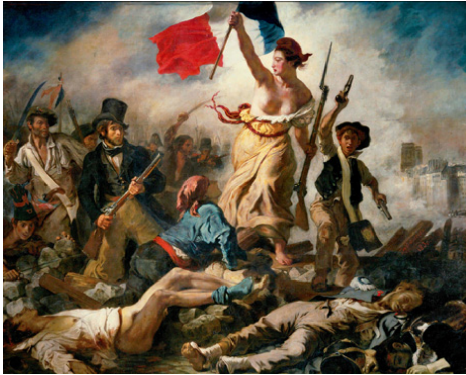
10. The enduring legend: Eugène Delacroix's Liberty Leading the People (1830).

Nor were such suspicions entirely groundless, in the sense that throughout the 19th century many political radicals had come to believe that the way to bring about revolution actually was through secret conspiracies. Before 1789 there was no such thing as a revolutionary. Nobody believed that an established order could be so comprehensively overthrown. But once it was shown to be possible, the history of France in the 1790s became the classic episode of modern history, whether as inspiration or warning, a model for all sides of what to do or what to avoid. Not even sympathizers could afford to accept that conspiracy was not a way to achieve revolution, because otherwise it would be the work of a blind fate beyond the influence of conscious human agency. And so the 1790s themselves saw secret groups plotting revolution in many countries of Europe. In Poland and Ireland they played a significant part in bringing about vast and bloody uprisings. Their defeated leaders who had turned to France for help, men like Tadeusz Kosciuszko and Wolfe Tone, have been revered ever since as prophets or martyrs of national independence. And when the Revolution in France itself began to disappoint its adherents, a genuine Jacobin plot was hatched—but