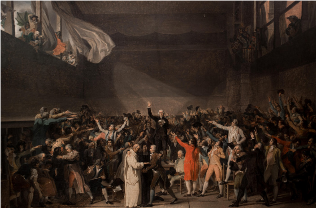
4. 20 June 1789: The Tennis Court Oath. The National Assembly vows never to disperse until it has given France a constitution.

Unknown to Necker, however, and perhaps at first to the king himself, ministerial orders had been issued on 26 June to certain regiments to converge on Versailles. More were ordered up in the weeks that followed, and by early July the nervous Assembly was importuning the king to withdraw the troops. He replied, plausibly enough, that their presence was necessary to secure public order; but when on 12 July Necker was dismissed more sinister suspicions seemed borne out. The 20,000 soldiers now encamped around the Île de France appeared poised to overawe the capital while action was taken to subdue the Assembly. On hearing the news about Necker, Paris exploded with a mixture of fear and indignation. Tentative moves by German mercenary troops to disperse crowds only made things worse, and members of the permanent Paris garrison of French Guards began to desert. Soon bands of hungry insurgents were ransacking strongpoints in the city for arms, powder, and hoards of flour. On 14 July they converged on the massive state prison of the Bastille, which