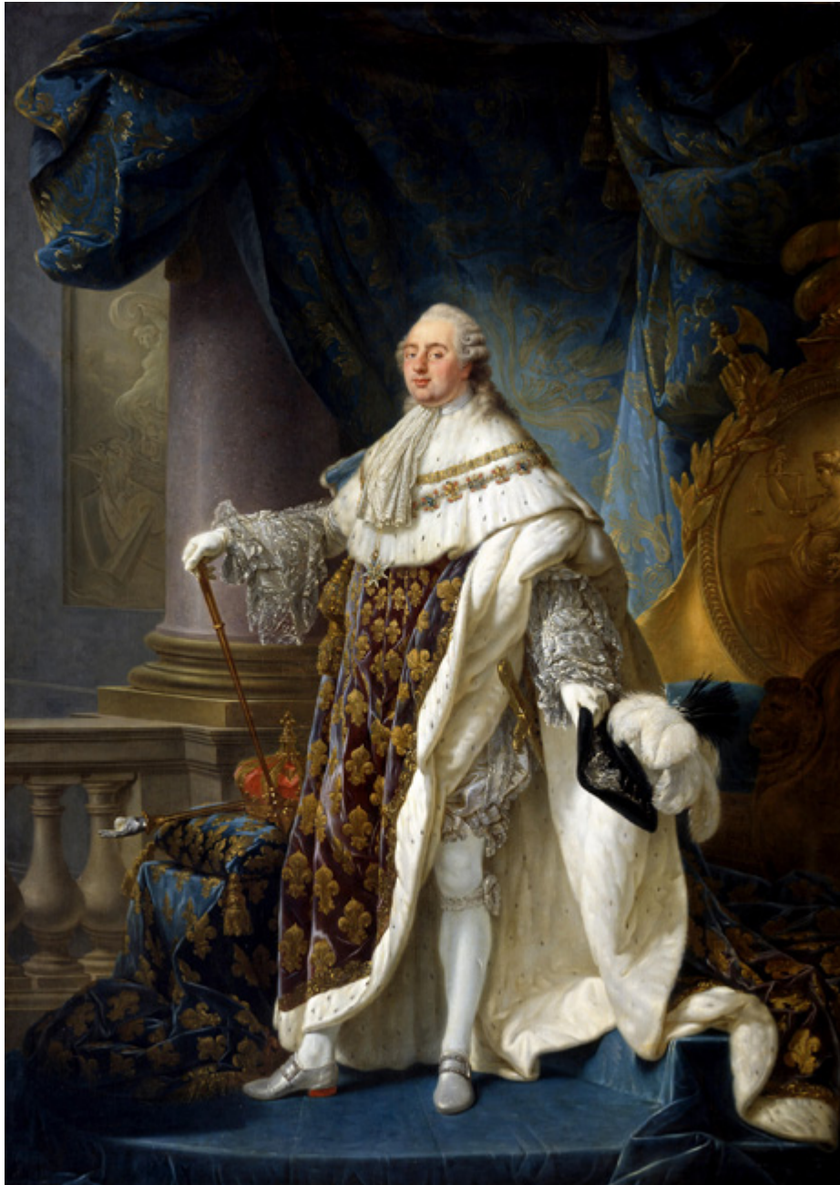
1. Louis XVI: The absolute monarch in all his glory.