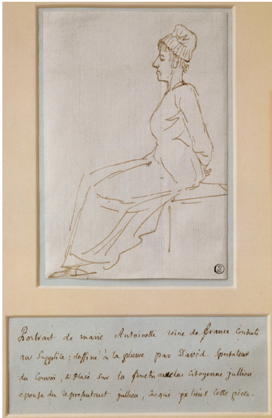
8. 16 October 1793: Jacques-Louis David's sketch of Marie-Antoinette on her way to the scaffold.

Terror appeared to have achieved its purpose of crushing internal opposition from every quarter. Even the sansculottes, drafted into the service of a