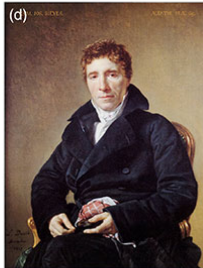
6. Revolutionaries: two victims, two survivors: (a) Danton; (b) Paine; (c) Robespierre; (d) Sieyès.