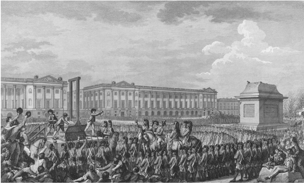
7. 21 January 1793: The execution of Louis XVI. Note the vacant pedestal where his grandfather's statue had previously stood.